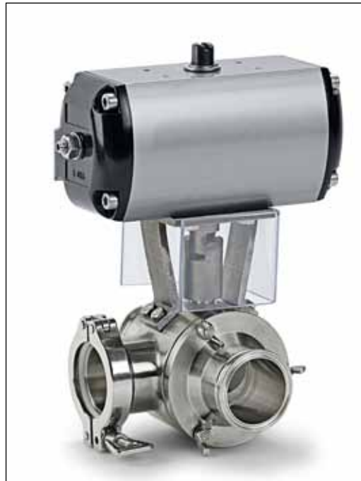
Separating system: Ball valve