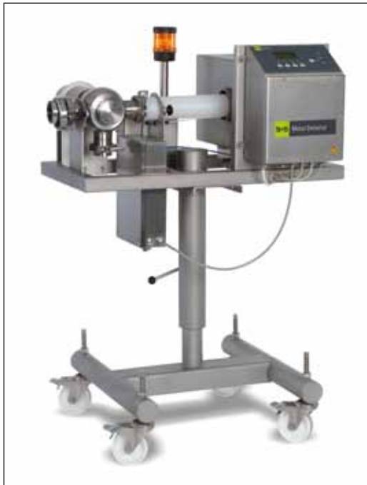
LIQUISCAN PL with height-adjustable stand